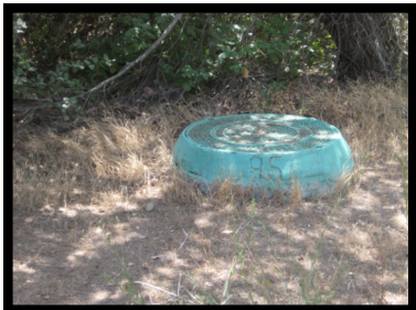
13. Manhole #95 32° 50.49 N 117° 12.93 W

Just right of trail Continue under overpass to find manhole #90