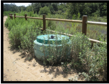
9. Manhole #115 32° 50.58 N 117° 12.69 W