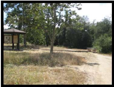
11. Manhole #118 32° 50.49 N 117° 12.81 W

On south side of parking lot, west of bathroom. Keep right and stay on the path.