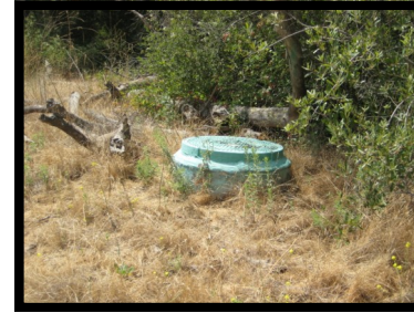
15. Manhole #89 32° 50.40 N 117° 13.16 W

40 feet left of path Next to telephone pole