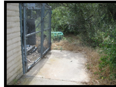
16. Manhole #88 32° 50.38 N 117° 13.22 W

Just behind the men's restrooms Follow trail on left of bathrooms to find MH #85