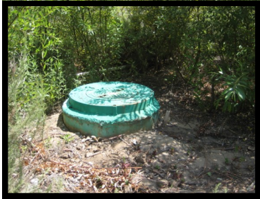
10. Manhole #116 32° 50.54 N 117° 12.76 W