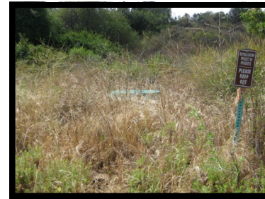
17. Manhole #85 32° 50.36 N 117° 13.37 W

Just behind the men's restrooms Follow trail on left of bathrooms to find MH #85