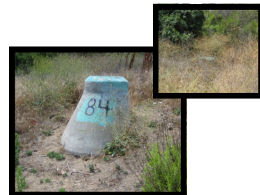
18 & 19. Manhole #84 & #82 32° 50.36 N 117° 13.39 W

MH # 84: right of trail MH # 82: directly behind MH # 84 May be hidden by brush!