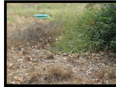
14. Manhole #90 32° 50.41 N 117° 13.11 W

Just right of trail Continue under overpass to find manhole #90