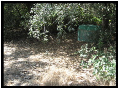
12. Manhole #117 32° 50.52 N 117° 12.84 W

On south side of parking lot, west of bathroom. Keep right and stay on the path.