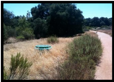
11. Manhole #4 32° 56' 4" N 117° 9' 59" W