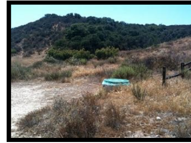
16. Manhole #15 32° 55' 54" N 117° 10' 17" W