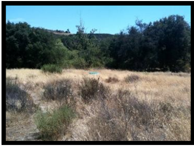
10. Manhole #5 32° 56' 5" N 117° 9' 55" W

Take path on left of trail for about 50 ft.