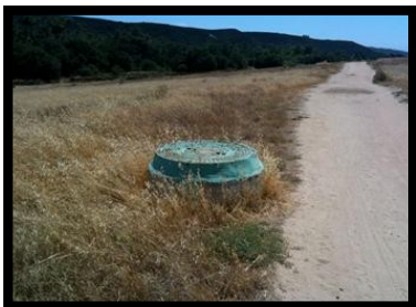
14. Manhole #17 32° 55' 56" N 117° 10' 10" W

Take path to right. Green post 30 ft. up slope. Continue on right of fork, following trail sign.