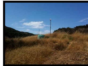
19. Manhole #12 32° 55' 47" N 117° 10' 32" W

About 20 ft. up slope on right of trail. Follow path on slope to right to reach #12.