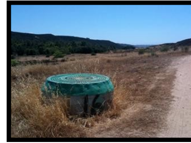
15. Manhole #16 32° 55' 54" N 117° 10' 14" W

Take path on left of trail for about 50 ft.