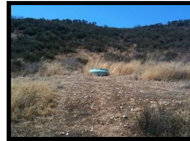
17. Manhole #14 32° 55' 52" N 117° 10' 20" W

On right side of trail. Continue straight at fork.