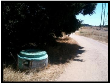
13. Manhole #9 32° 56' 1" N 117° 10' 5" W

About 30 ft. up slope on right of trail.