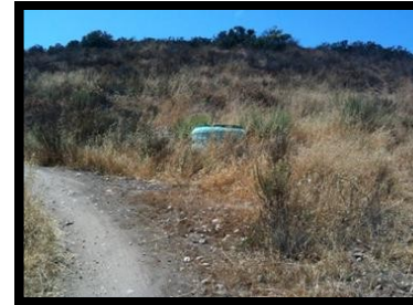
18. Manhole #13 32° 55' 49" N 117° 10' 27" W

Take path to right. Green post 30 ft. up slope. Continue on right of fork, following trail sign.