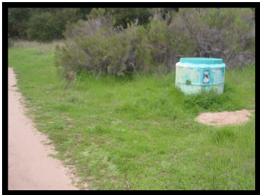
12. Manhole #8 32° 56' 3" N 117° 10' 2" W

On right side of trail. Continue straight at fork.