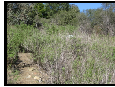
15. Manhole #243 32° 43.62 N 117° 07.19 W

MH on left hillside. Backtrack to Juniper St, cross street to trail and head right.