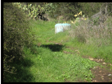
23. Manhole #315 32° 43.99 N 117° 07.23 W