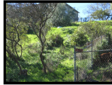
25. Manhole #313 32° 43.96 N 117° 07.23 W

Up hill to the right (just past fenced yard).