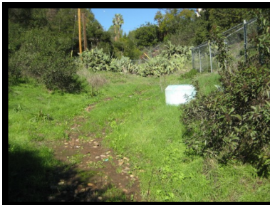
24. Manhole #338 32° 44.01 N 117° 07.24 W