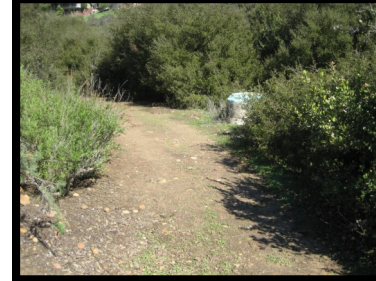
18. Manhole #299 32° 43.87 N 117° 07.20 W

12 ft right of path. At 3-way intersection, make hard right to MH #488.