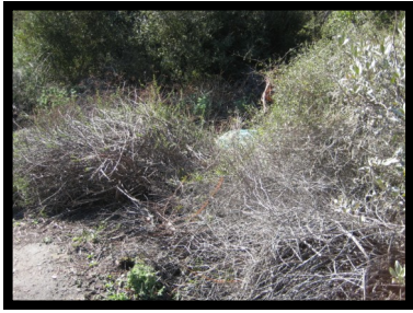
10. Manhole #479 32° 43.64 N 117° 07.27 W