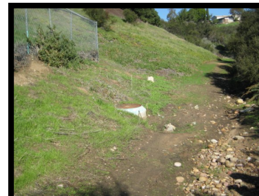
17. Manhole #300 32° 43.84 N 117° 07.23 W

5 ft right of path (behind cactus). Continue left of 'Private Property' sign to find new path.