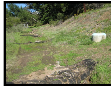
19. Manhole #304 32° 43.91 N 117° 07.20 W

MH on path, next to fence. Head back to intersection and head right to continue on path.