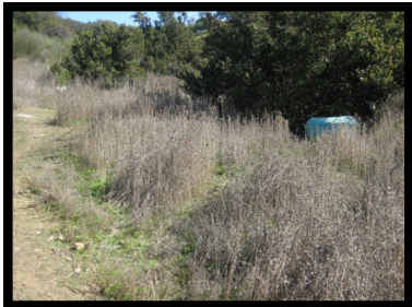
13. Manhole #485 32° 43.59 N 117° 07.19 W

12 ft right of path. At 3-way intersection, make hard right to MH #488.