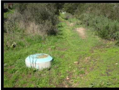
22. Manhole #314 32° 43.96 N 117° 07.22 W