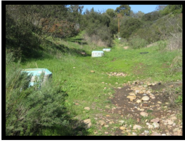
20. Manhole #311 32° 43.95 N 117° 07.22 W