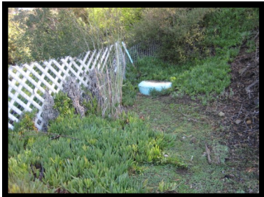
14. Manhole #488 32° 43.60 N 117° 07.16 W

Right of path. Continue on trail to next MH.