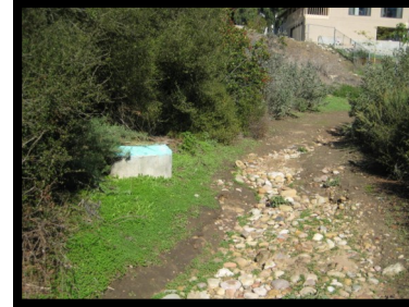
16. Manhole #290 32° 43.81 N 117° 07.26 W

Right of path. Continue on left path, up hill to MH #481.