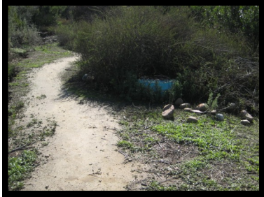
11. Manhole #480 32° 43.63 N 117° 07.26 W

MH on left hillside. Backtrack to Juniper St, cross street to trail and head right.