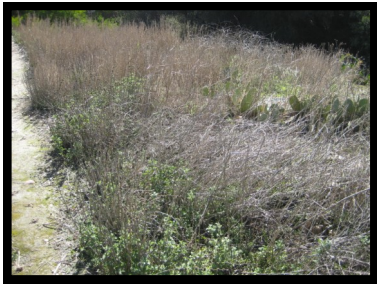
12. Manhole #481 32° 43.60 N 117° 07.24 W

5 ft right of path (behind cactus). Continue left of 'Private Property' sign to find new path.