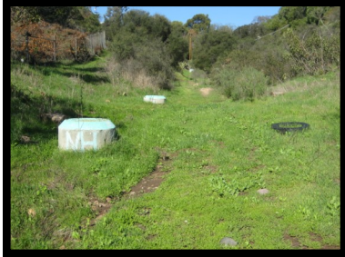
21. Manhole #312 32° 43.96 N 117° 07.22 W